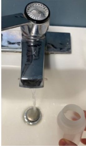
Do NOT overfill