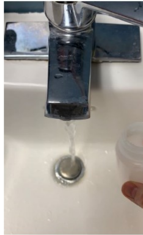
Do NOT let bottle touch tap