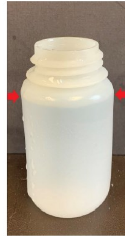
Fill to just below bottle neck